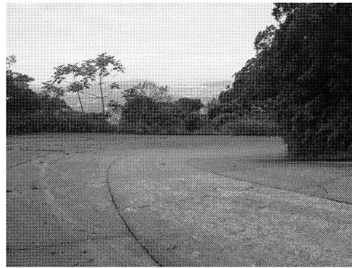
Fig.2. View of Sea Way (pictured in April, 2007).

The year of 1928 was another milestone in Brazilian concrete road construction when the hill segment of the roadway linking Rio de Janeiro to the city of Petropolis, also in the Atlantic rain forest, was re-constructed. Originally paved with asphalt, the hill segment, 22km long, 2-lane concrete road with shoulder was completed in 1931. It was considered the best road in Brazil at that time for many years. The construction of these concrete roads was emblematic in a period when most of urban streets and roads were paved using hydraulic macadam with thin asphalt surface layer.