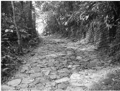
Fig. 1. View of Lorena's Sidewalk (pictured in April, 2007).

The first concrete road in Brazil (also the first in South America) was built in 1926 at the same site of Lorena's Sidewalk and was named the "Caminho do Mar" (Sea Way) road. This road passed through the hills of Atlantic rain forest, linking São Paulo city to the shore region of the state (Fig. 2). This 8km long, 2-lane concrete road was paved with concrete mixed in place using rudimentary concrete mixer moving over rails. The steep longitudinal slope of 7% presented some challenges to the paving operation.